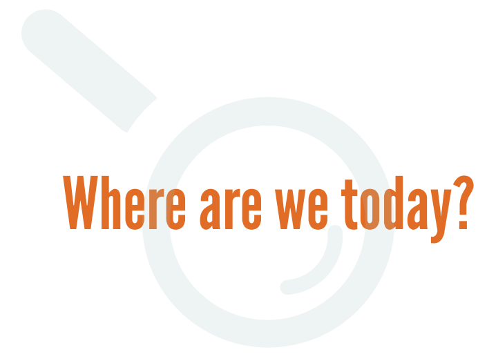
Cumberland County: 3rd Grade Reading Proficiency

2021 Benchmark: 61% of children read proficiently at the end of 3rd grade